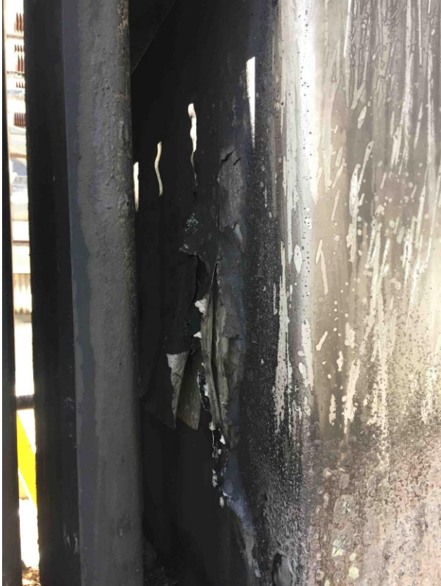
Damage to SST