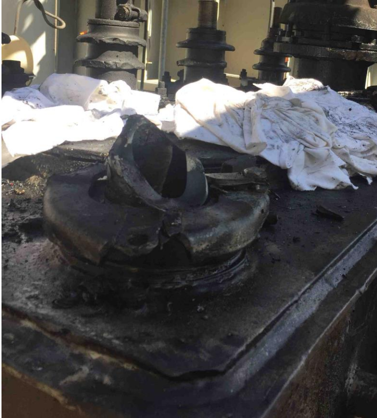
Bushing on top of SST