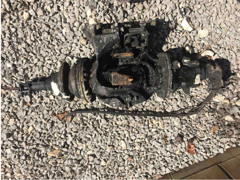
Failed current transformer (CT)